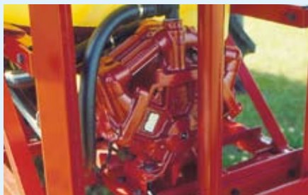
1303 for reliable operation