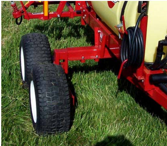
The optional tandem axle and 23 X 10.5 – 12 tires allow for a smooth ride in rough field conditions. Adjustable from 40"-80" width. ( Walking axle must be reversed for 40" track width)