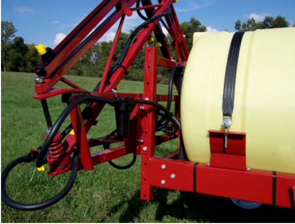
Boom height can be adjusted from 20"-40" for a variety of crop conditions.