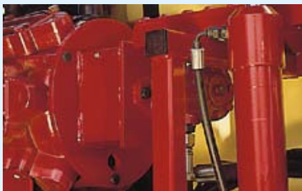
363 with hydraulic drive