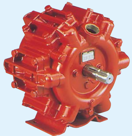
363 with splined shaft